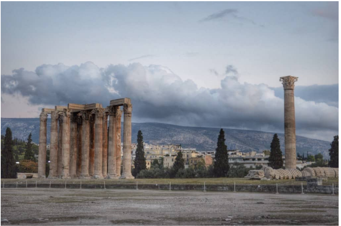
Temple of Olympian Zeus